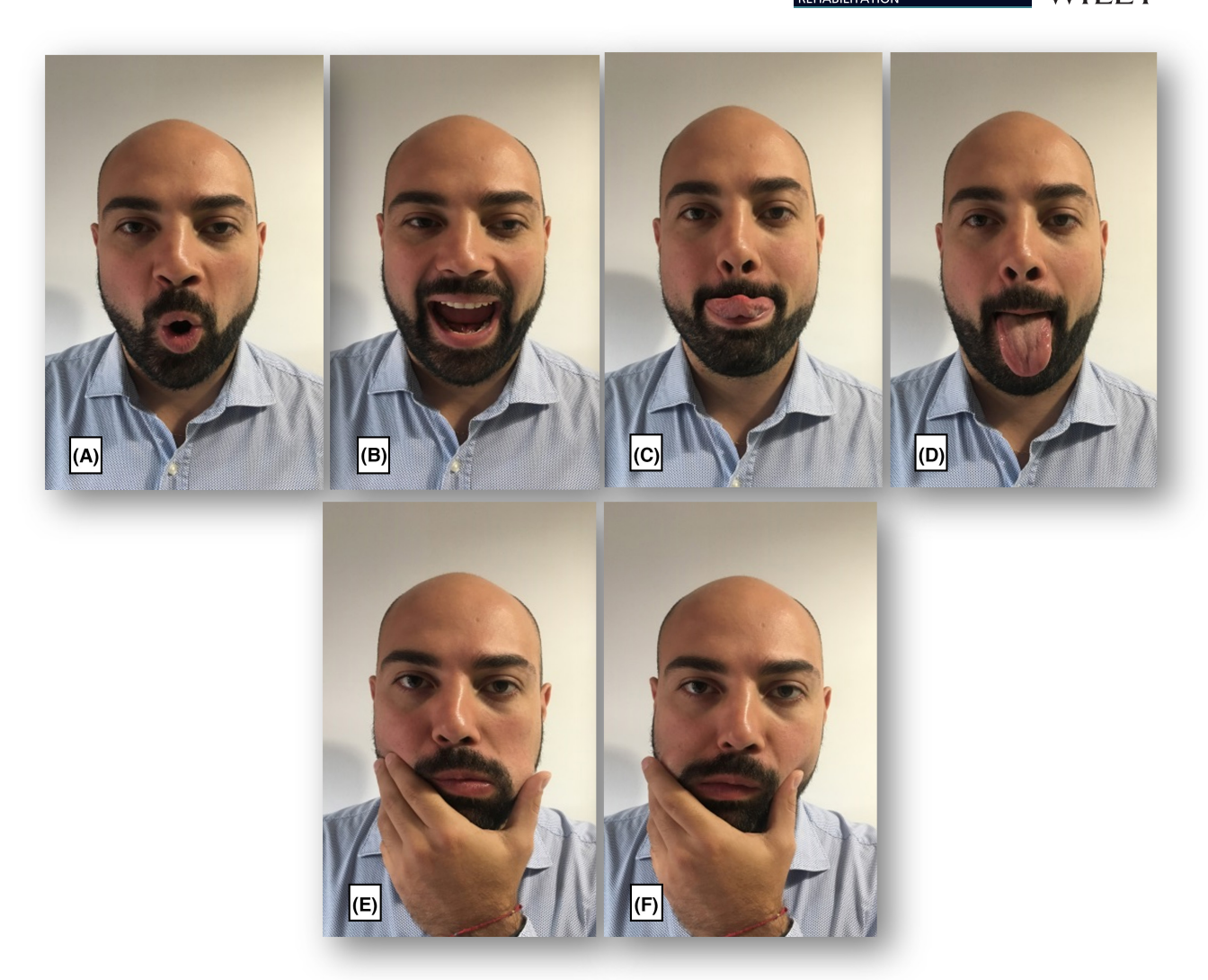
FIGURE 2 Oro-facial myofunctional therapy assigned at home: (A, B) letter 'O' and 'A', making the tongue adhere to the palate and snaping it off by opening the mouth (A–O); (C, D) nose-chin tongue, trying to touch the nose with the tip of the tongue, and then, trying to touch the chin; (E, F) tongue-cheeks, push the tongue against the cheek, 10 times to the right, 10 times to the left.

power of analysis of 95%, an alpha error of .05, and a drop-out of 10%, the resulting sample size for each group was 21 subjects for each group.